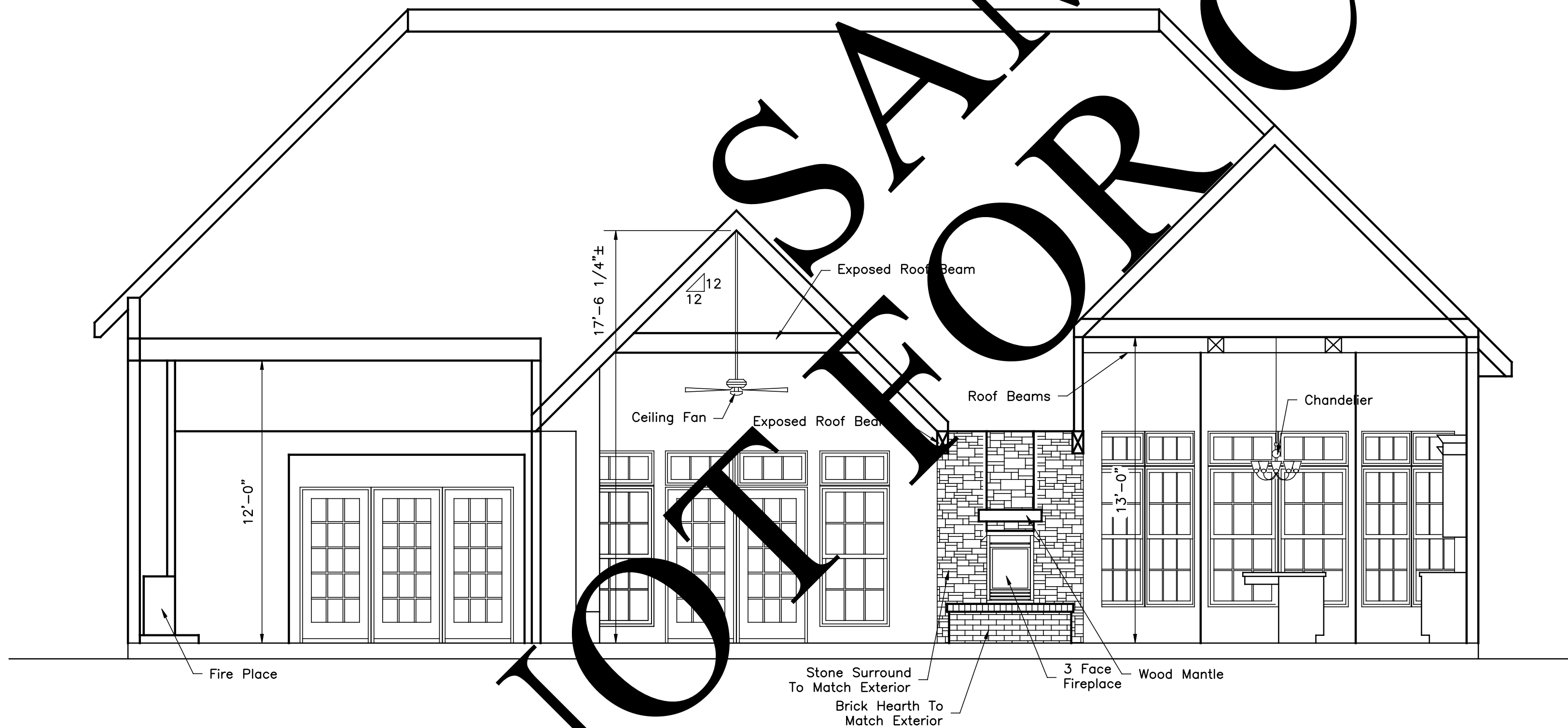
BUILDING CROSS SECTION SCALE: 1/4"=1'-0"